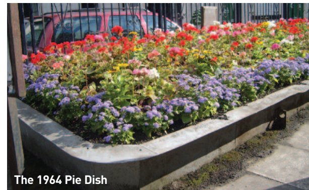
The 1964 Pie Dish

Trains to Denby Dale from Huddersfield, Penistone, Barnsley and Sheffield run hourly Monday to Saturday with 8 trains each way on Sundays.